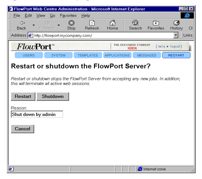
Figure 5.1 Restart page

To restart or shut down the FlowPort service: